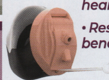
Invisible IIC Made in USA